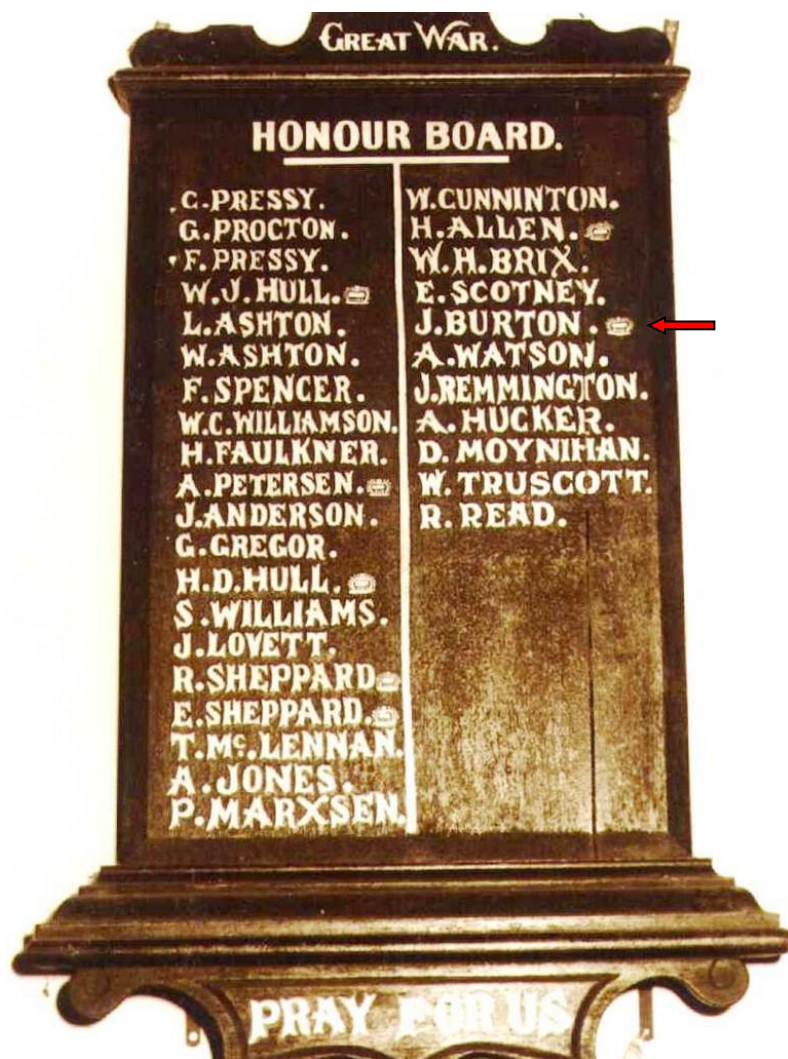
Tegege Hall Honour Board